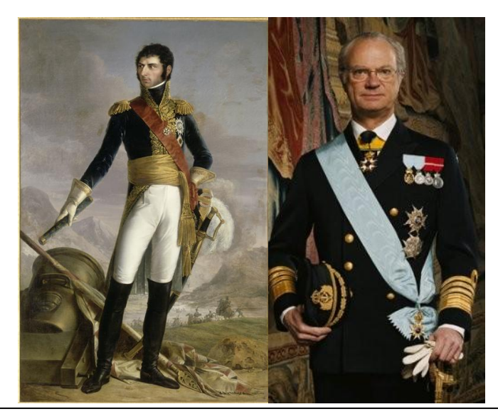
(L) Marshal Jean-Baptiste Bernadotte, later Sweden's King Karl XIV Johan, on the battlefield holding the baton of a Napoleonic general; and (R) his descendant, Karl XVI Gustav, King of Sweden, in modern regimentals.

Wartime upheavals, as during the Napoleonic wars, often provided scope for dramatic changes of fortune, particularly for men. Traditionally, however, women's opportunities were much more restricted. Classic advancement options for poor but able females were posts within religious communities; or roles within the arts, especially the performing arts; or, for women with beauty and/or sexual allure, the risky life of a courtesan – or the comparatively rare chance of marrying 'up' the social scale.