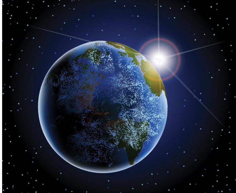
Fig.3 View of Planet Earth from Space

Lastly, if we do want a physical monument to either Space or Time, there's no need for a special trip to Paris. We need only look around us. The unfolding Space-Time, in which we all live, looks exactly like the entire cosmos, or, in a detailed segment of the whole, like our local home: Planet Earth.