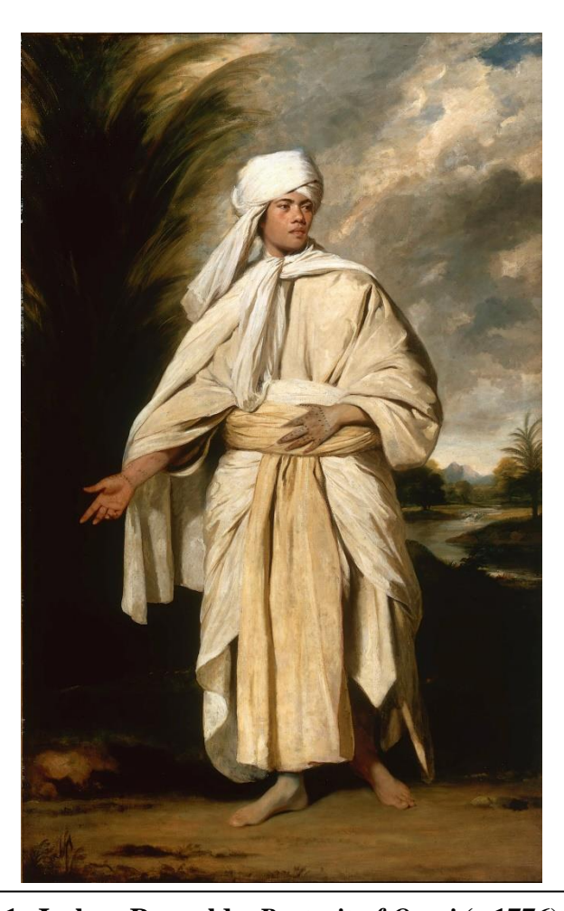
Image 1: Joshua Reynolds, Portrait of Omai (c.1776) This cultural ambassador to Britain from the other side of the world is shown in 'exotic' robes and with bare feet - but his pose is open and friendly, and his gaze (said to be a good likeness) is candid.