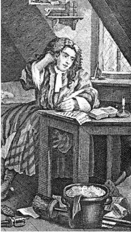
Hogarth's Distrest Poet (1741) expresses the agonies of composition, as he sits in a poky garret, poor and dishevelled, with abandoned drafts at his feet.

Writing and research in the Humanities and Social Sciences should thus proceed in tandem. These tasks between them provide the necessary legs which enable a project to advance. No supervised researcher should be without a target deadline for a forthcoming report or interim paper, which collectively function as prototype chapters. That rule applies from the onset, starting with a written review of the research questions, or bibliographical overview, or primary source search – or however the project is launched. Without ‘writing through’, researchers do not really appreciate what they have found or what they are arguing. Certainly there will be much redrafting and revision, as the research progresses. That’s all part of the process.