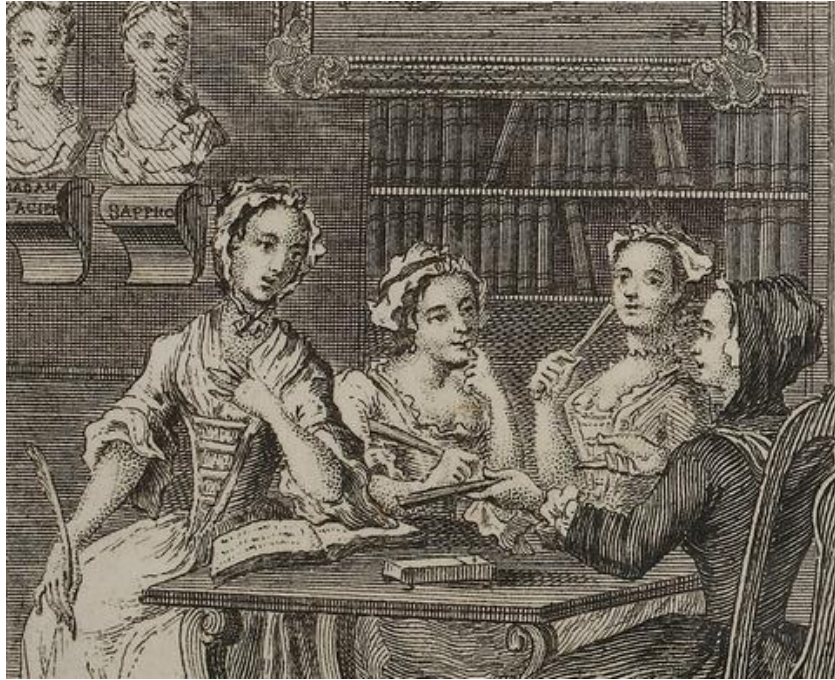
Young ladies in an eighteenth-century library, being instructed by a demure governess, under a bust of Sappho – a legendary symbol of female literary creativity.

As time elapsed, however, the diffusion of female literacy proved to be the thin end of a large wedge. Girls did indeed have brainpower – in some cases exceeding that of their brothers. Why therefore should they not have access to regular education? Given that the value of Reason was becoming ever more culturally and philosophically stressed, it seemed wise for society to utilise all its resources. That indeed was the punchiest argument later used by the feminist John Stuart Mill in his celebrated essay on The Subjection of Women (1869). Fully educating the female half of the population would have the effect, he explained, of ‘doubling the mass of mental faculties available for the higher service of humanity’. Not only society collectively but also women and men individually would gain immeasurably by accessing fresh intellectual capital. 3