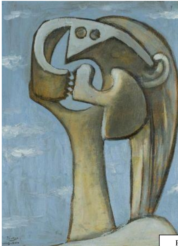
Pablo Picasso, Femme (1930).

reaction was incredulous laughter. Women who spoke out on behalf of women's rights were caricatured as bitter, frustrated old maids. A further male response was to conjure up images of the 'vagina dentata' – the toothed vagina of mythology. It hinted at fear of sex and/or castration anxiety. And it certainly dashed women from any maternal pedestal: their nurturing breasts being negated by the biting fanny.